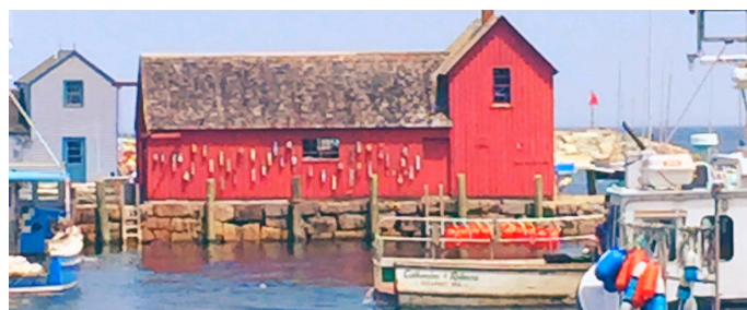
Charming Rockport, Massachusetts

We have taken every drive, eaten in every restaurant and visited every destination on the tour. You won't find a more complete New England tour than this. The above prices include an air allowance of $350. Comparable tours from national tour companies are over $2,500 per person without airfare!