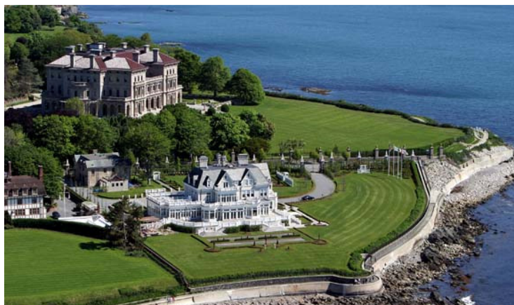
The Breaker's Mansion in Newport, Rhode Island

We have taken every drive, eaten in every restaurant and visited every destination on the tour. You won't find a more complete New England tour than this. The above prices include an air allowance of $350. Comparable tours from national tour companies are over $2,500 per person without airfare!