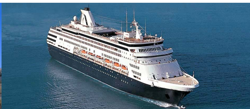
Holland America's elegant m/s Maasdam