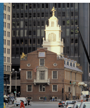
Old Statehouse – Boston