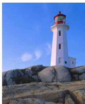
Peggy's Cove Lighthouse

Discover the unique history, stunning beauty and diverse cultures of Canada and New England. Walk Boston's Freedom Trail, explore Prince Edward Island, and immerse yourself in the French inspired wonders of Québec City and Montréal. You'll be so close to home and yet you will feel as if you are worlds away. Come and join us on this wonderful cruise!