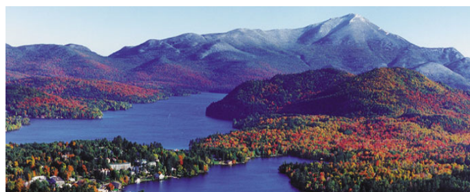
Charming Lake Placid, New York

We have taken every drive, eaten in every restaurant and visited every destination on the tour. You won't find a more complete New England tour than this. The above prices include an air allowance of $350. Comparable tours from national tour companies are over $2,500 per person without airfare!