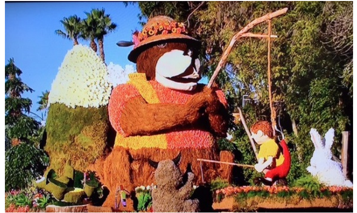
Beautiful Rose Parade in Pasadena

Featuring the 129th annual Tournament of Roses Parade (and MUCH more)!