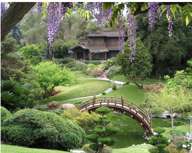
Huntington Library and Gardens

When you see what you get for the price, you'll agree that it's a great value. So don't trust your Rose Parade experience to just anyone. Join us for Utah's most popular Rose Parade Tours!