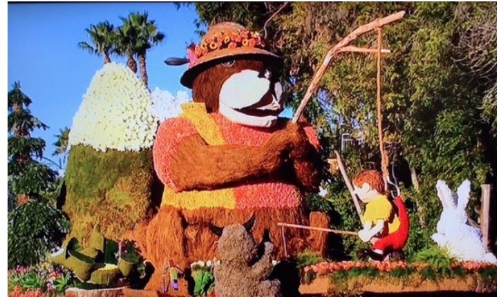
Beautiful Rose Parade in Pasadena

Featuring the 129th annual Tournament of Roses Parade (and MUCH more)!