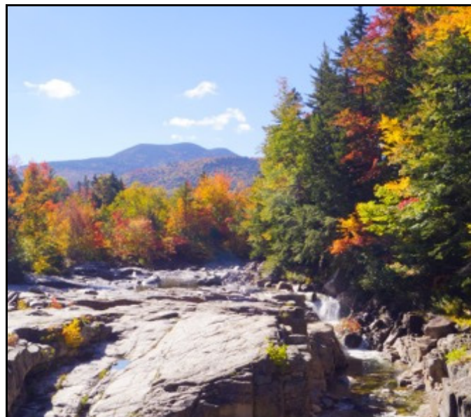
Including New Hampshire (above) and Vermont in the Fall

Tips for baggage handling, taxes and hotel gratuities except gratuity to your driver and local guides