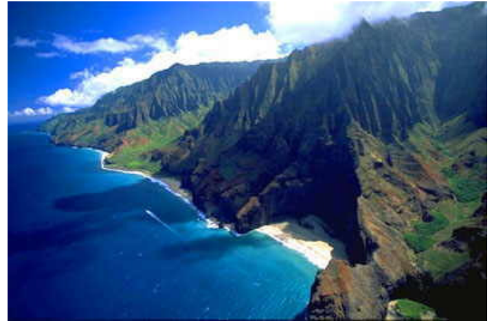
Kauai's Na Pali Coast There is no place like Hawaii!