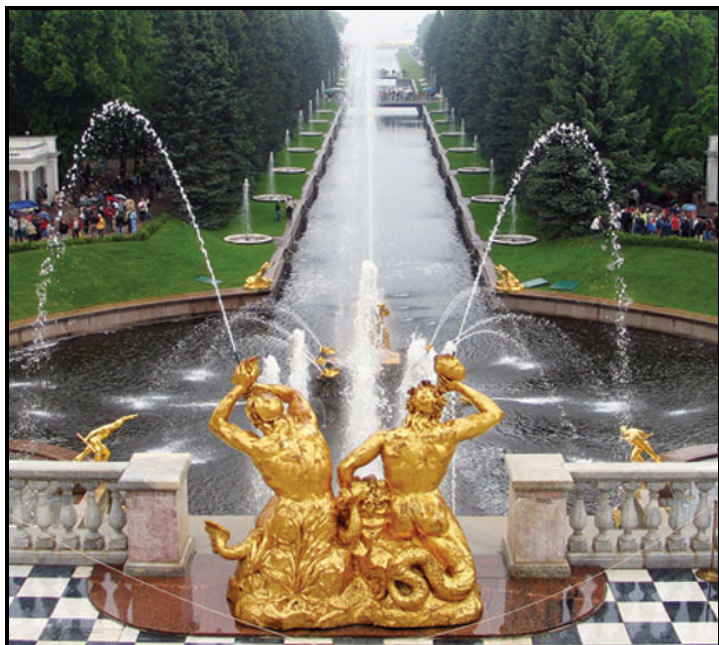
St. Petersburg, Russia

We have negotiated EXCELLENT pricing for this 11 DAY Northern Europe Cruise. Register EARLY for best stateroom availability and location. We have enough staterooms for 40 people. They are available on a first come/first served basis. A passport is required for this cruise